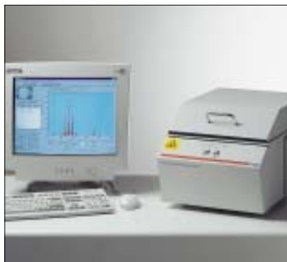
FISCHERSCOPE® X-RAY XAN energy dispersive spectrometer for quantitative material analysis from Al(Z=13) to U(Z=92).

to the X-ray fluorescent, Beta Backscatter, magnetic induction, eddy current and coulometric methods. Additionally, the program includes instruments for measuring micro-hardness, ferrite content, and porosity testing. FISCHER is active around the world. Instruments manufactured by our company are used in many countries. FISCHER has subsidiaries in eight different countries.