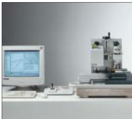
FISCHERSCOPE® H100C with WIN-HCU® for the measurement of the microhardness HM according to DIN EN ISO 14577 and DIN 55676.