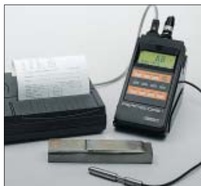
FERITSCOPE® MP30 for standardized non-destructive measurement of the ferrite content in austenitic welded products or in duplex steel.

The high quality standard of FISCHER instruments is the result of our efforts to provide the very best instrumentation to our customers.